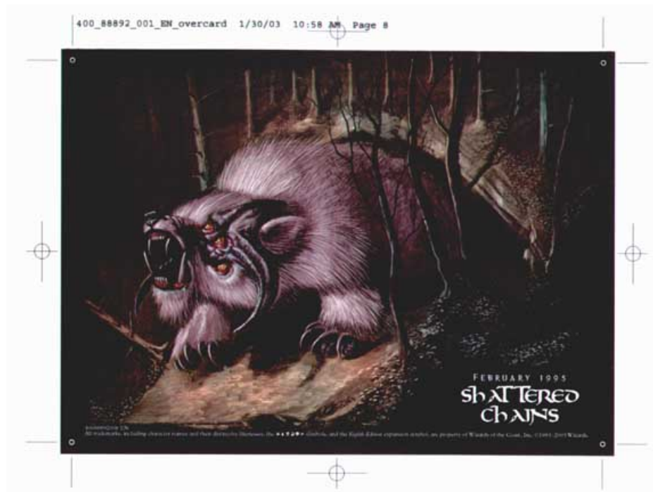
The design for the back of the never-produced Giant Badger box topper.